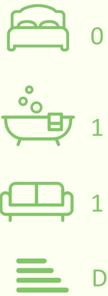
Guildgate House, High Street, Crowthorne Approximate Area = 420 sq ft / 39 sq m For identification only - not to scale