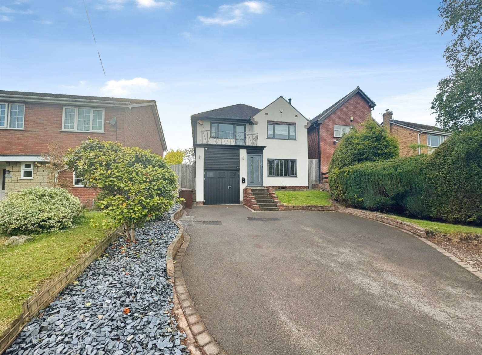
Stourbridge Road, Bromsgrove