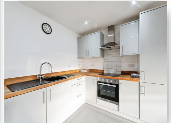
Raebarn House, Hulbert Road, Waterlooville PO7 7FH