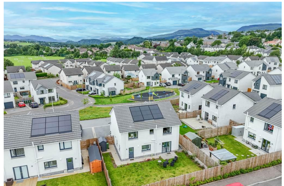
Next Home - 7 Jura Way, Crieff, PH7 3FX