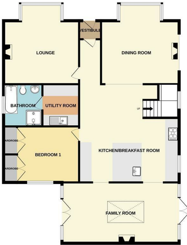
1ST FLOOR 624 sq.ft. (58.0 sq.m.) approx.