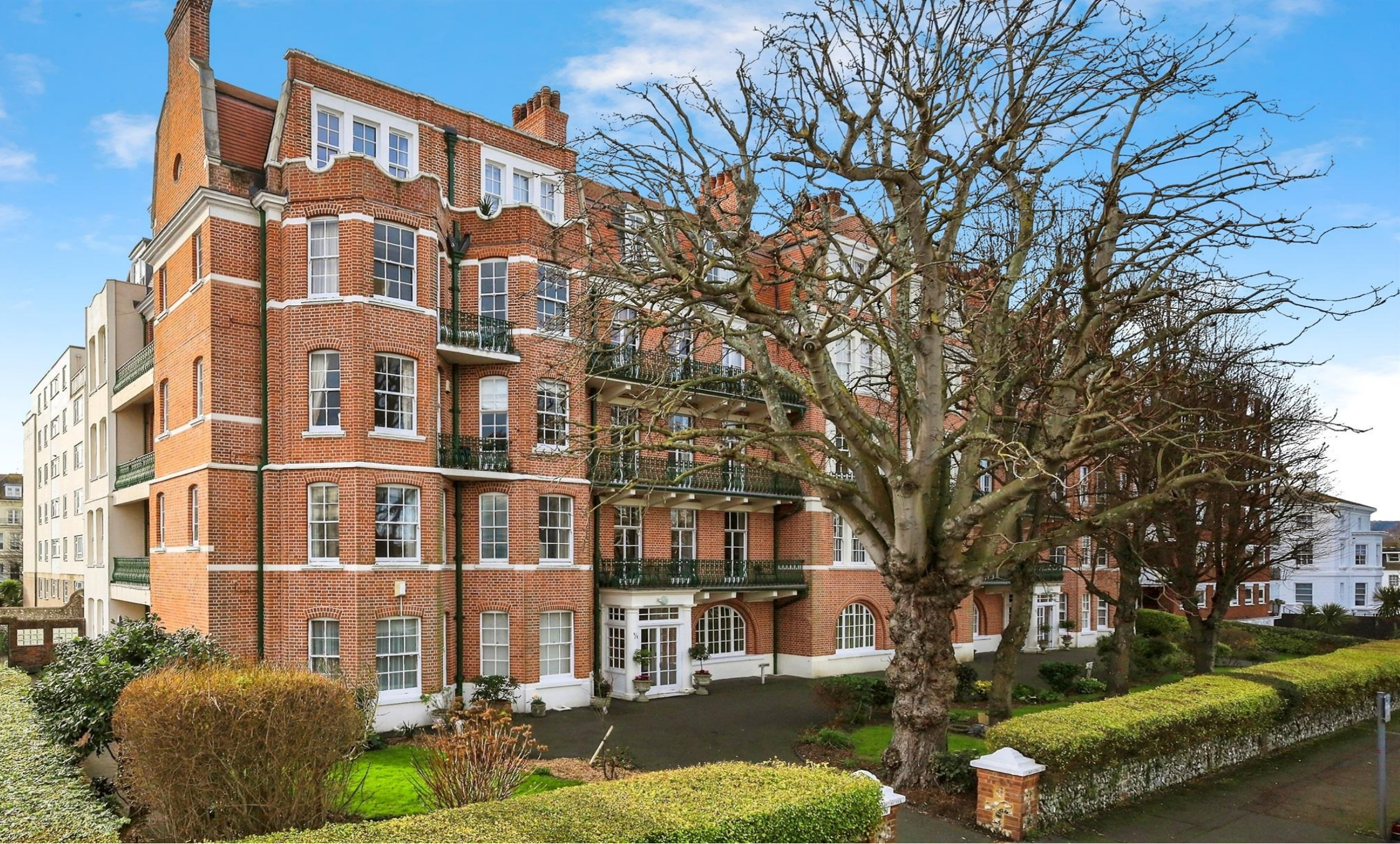
Hartington Mansions Hartington Place, Eastbourne BN21 3BJ