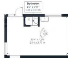
Annexe Ground Floor