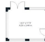
Garden Room / Studio