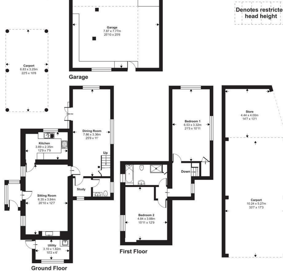
Floor plan produced in accordance with RICS Property Measurement 2nd Edition, Incorporating International Property Measurement Standards (IPMS2 Residential). © nichecom 2026. Produced for Stags. REF: 1408666