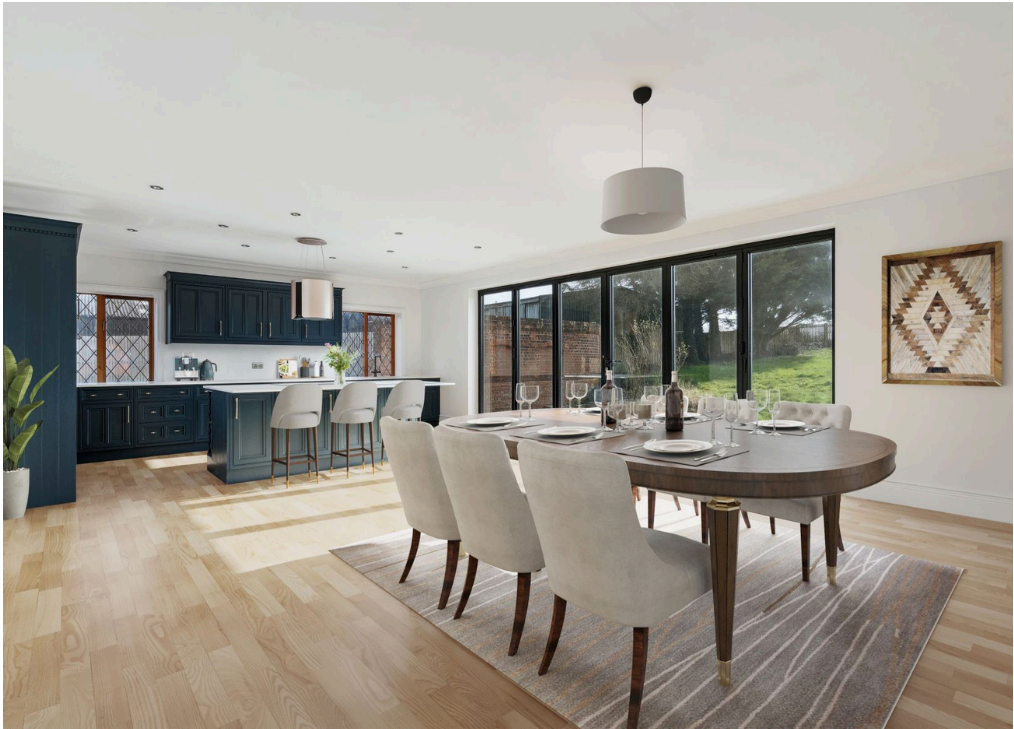
BRICK KILN FARMHOUSE, AMERSHAM