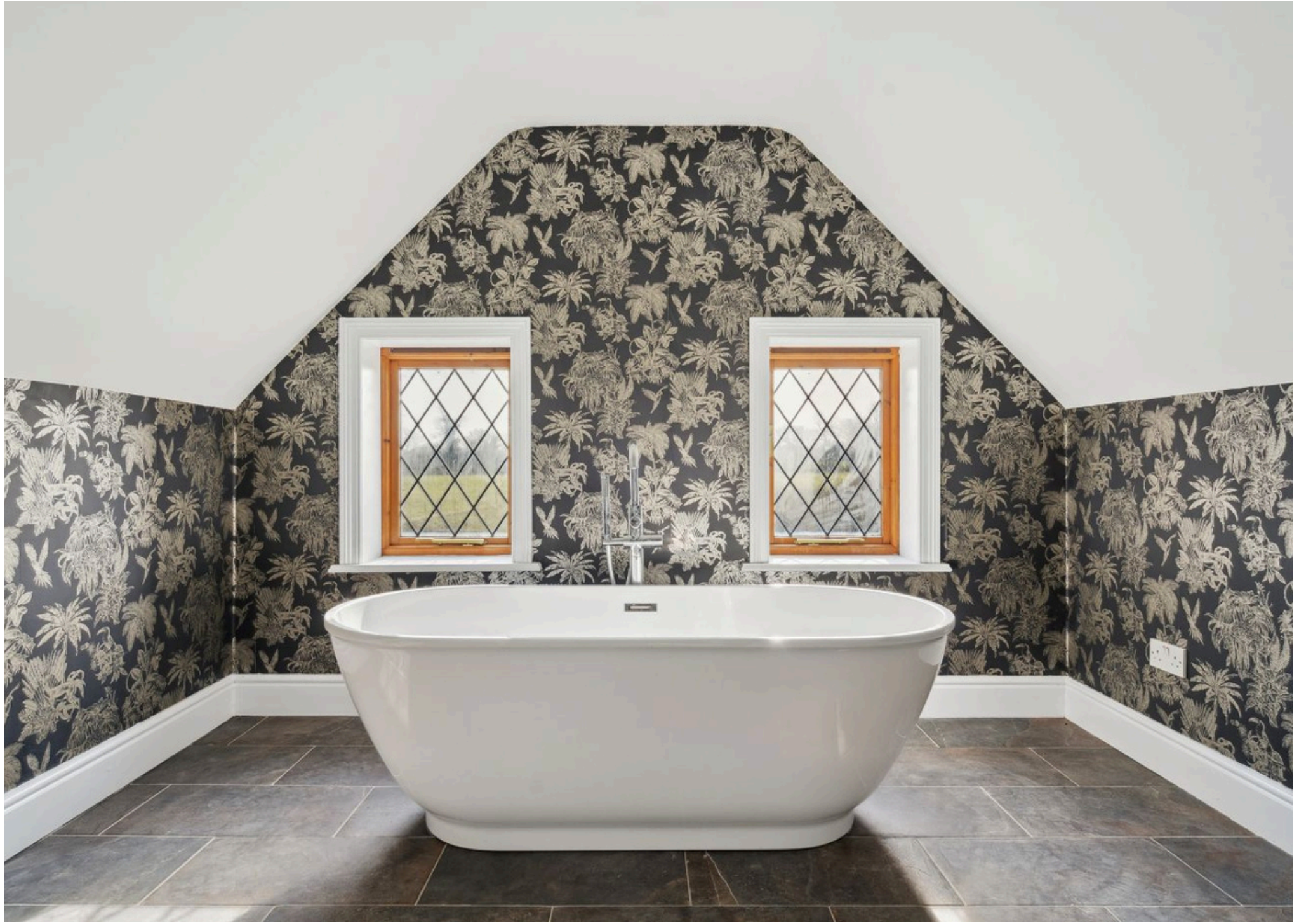
BRICK KILN FARMHOUSE, AMERSHAM