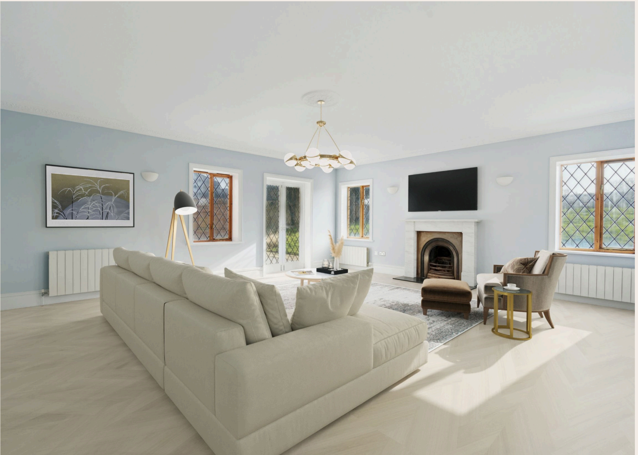
BRICK KILN FARMHOUSE, AMERSHAM