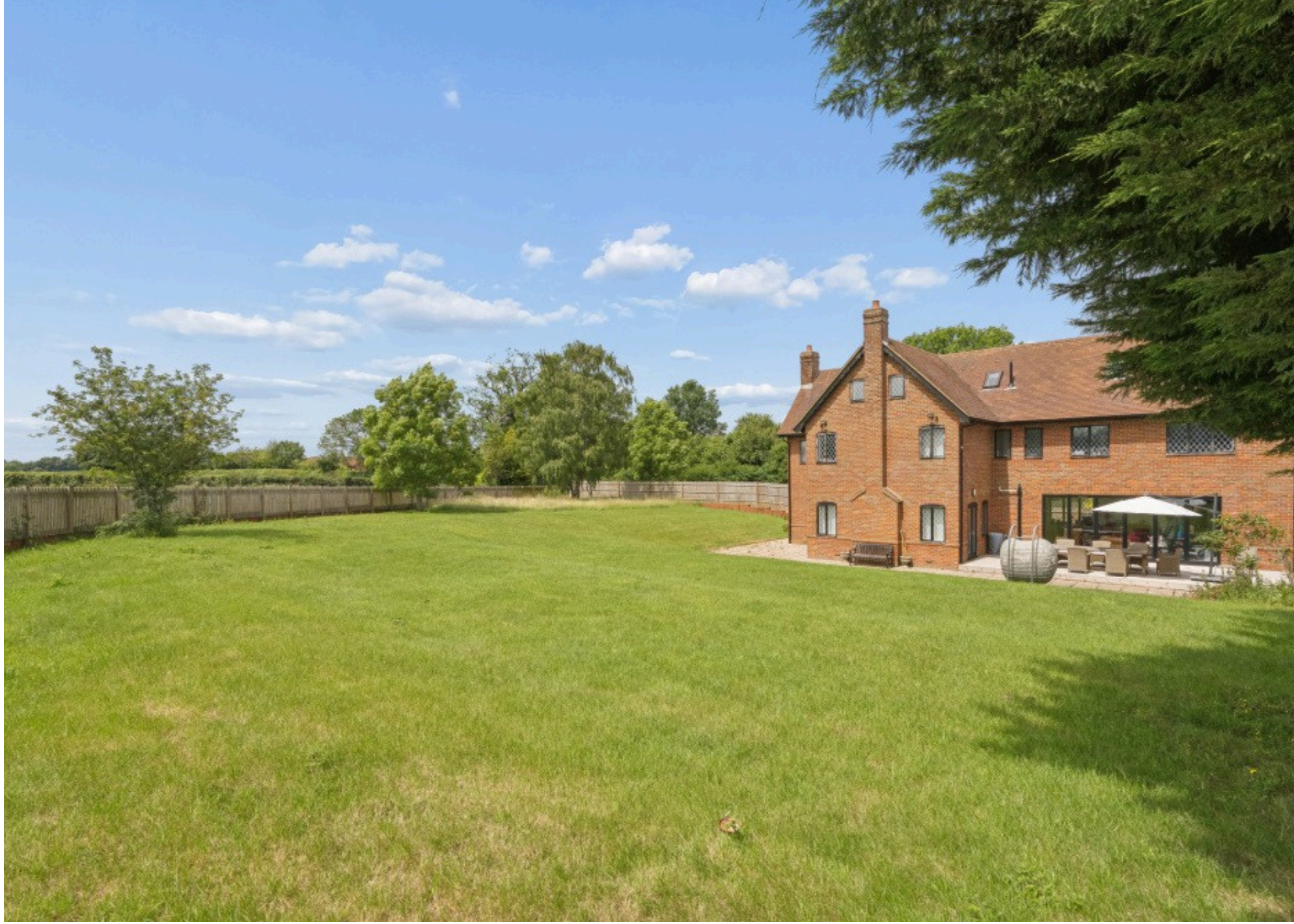
BRICK KILN FARMHOUSE, AMERSHAM