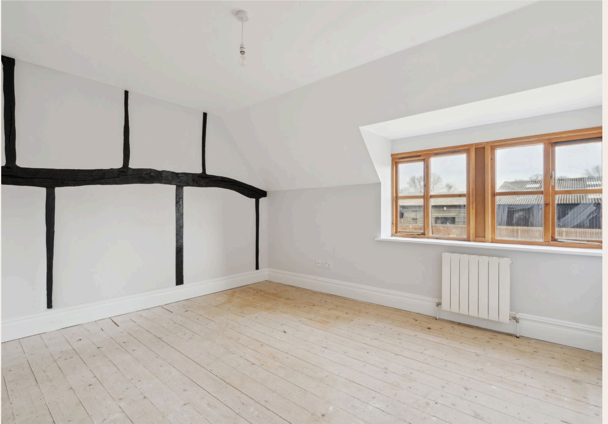
BRICK KILN FARMHOUSE, AMERSHAM