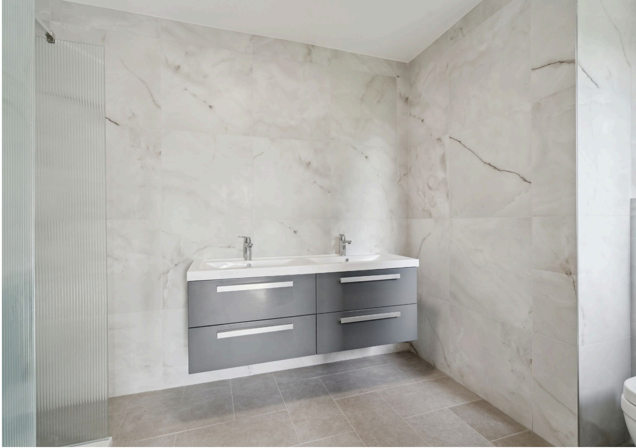
BRICK KILN FARMHOUSE, AMERSHAM