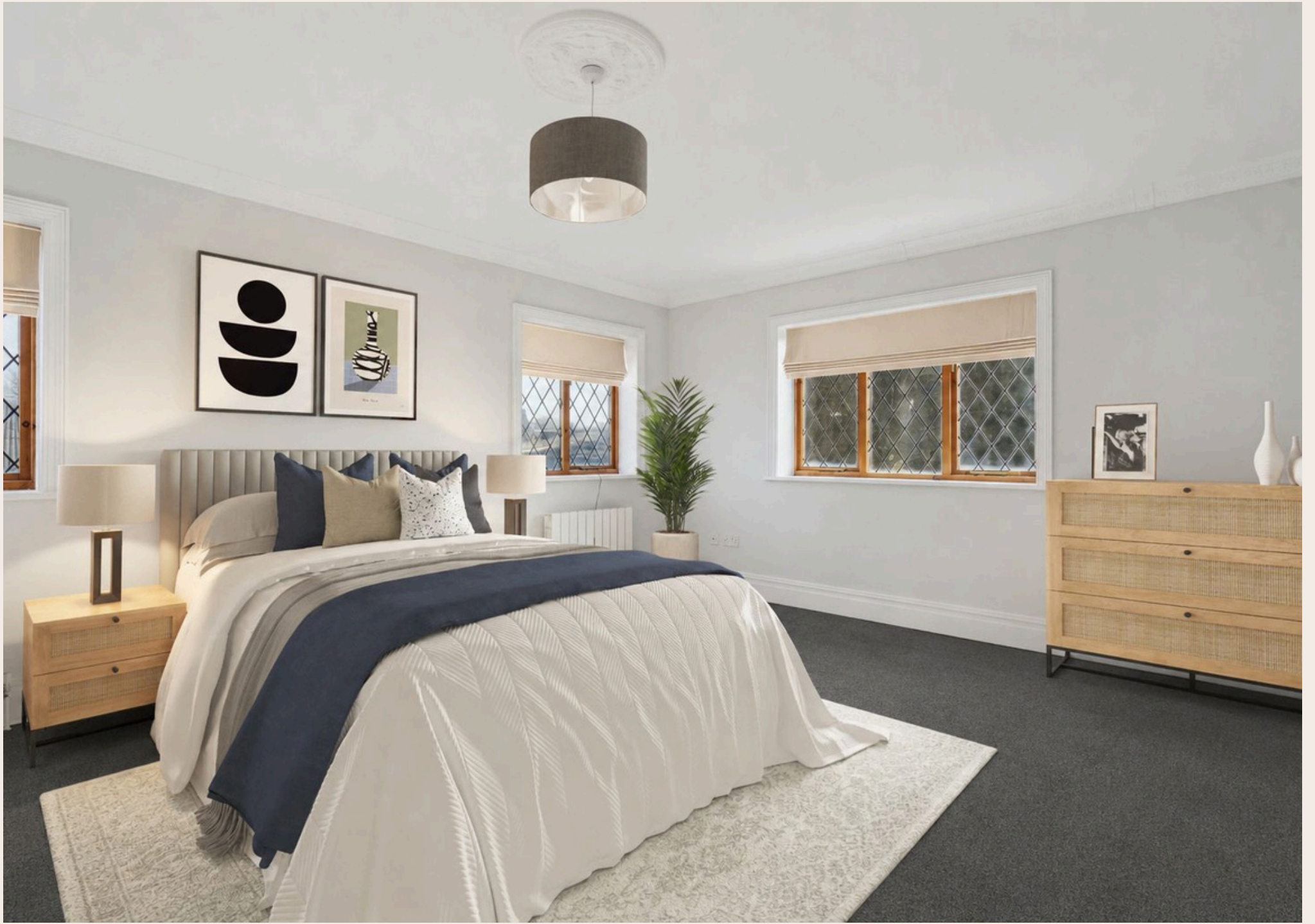
BRICK KILN FARMHOUSE, AMERSHAM