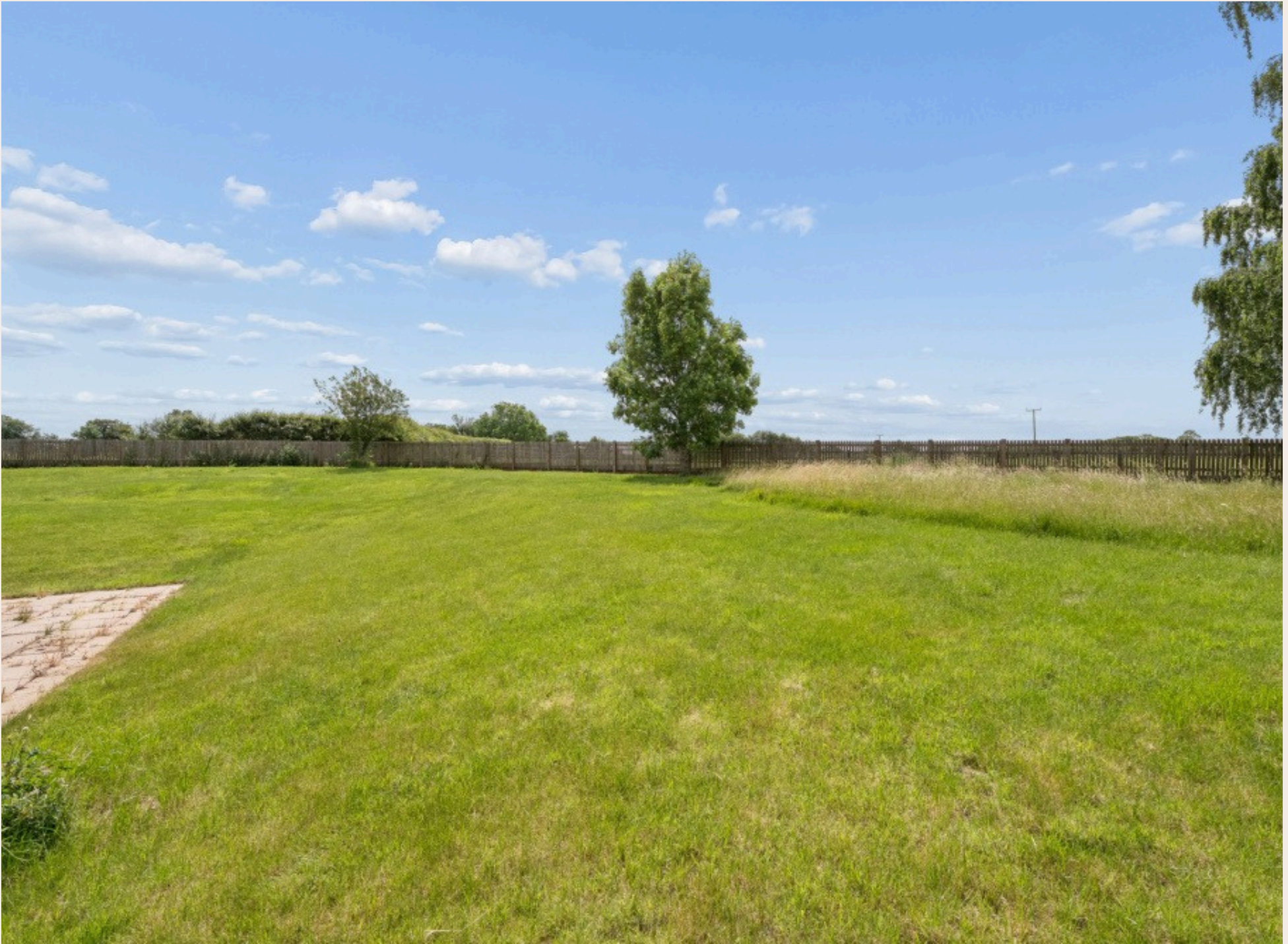
BRICK KILN FARMHOUSE, AMERSHAM