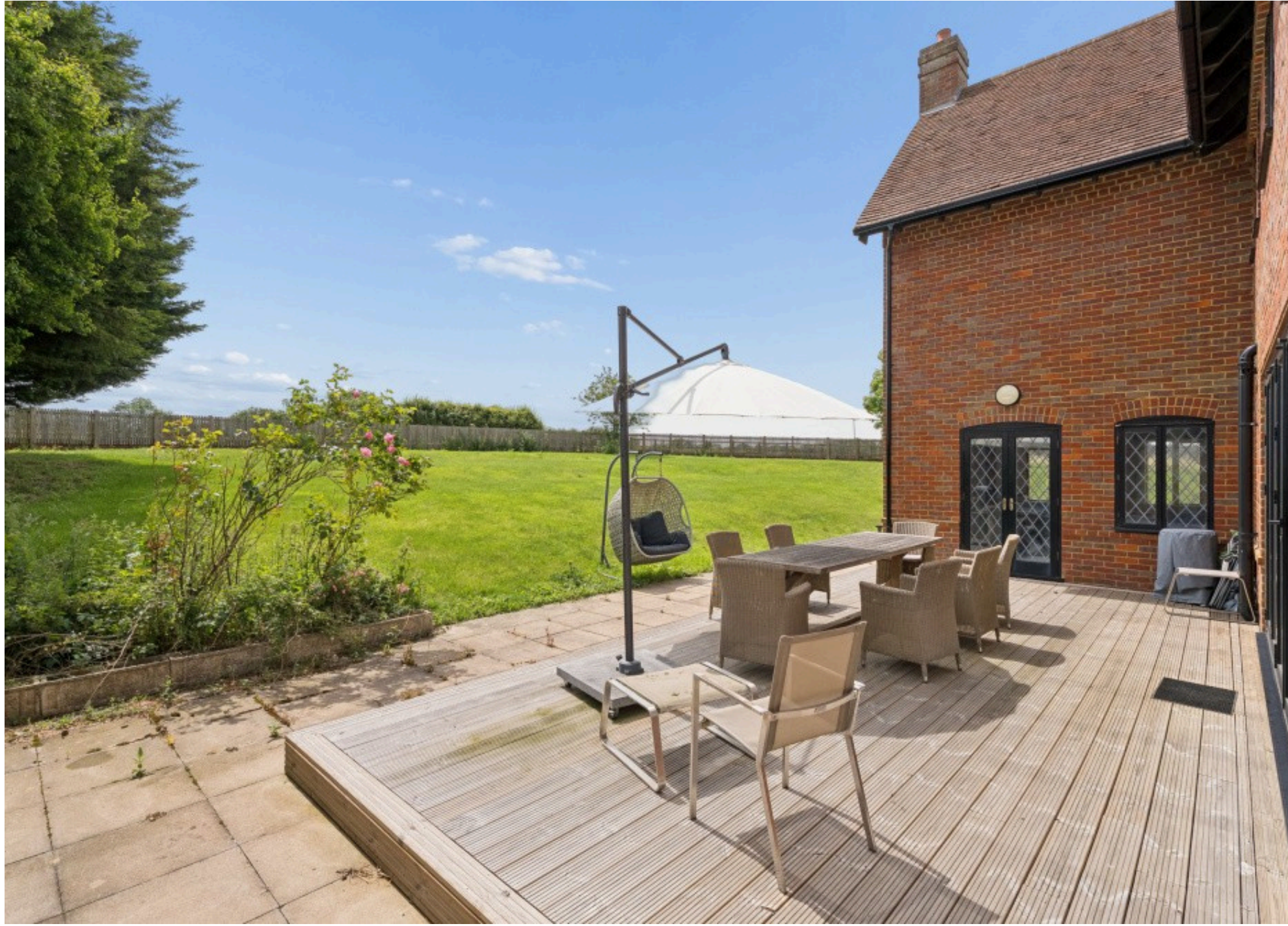
BRICK KILN FARMHOUSE, AMERSHAM