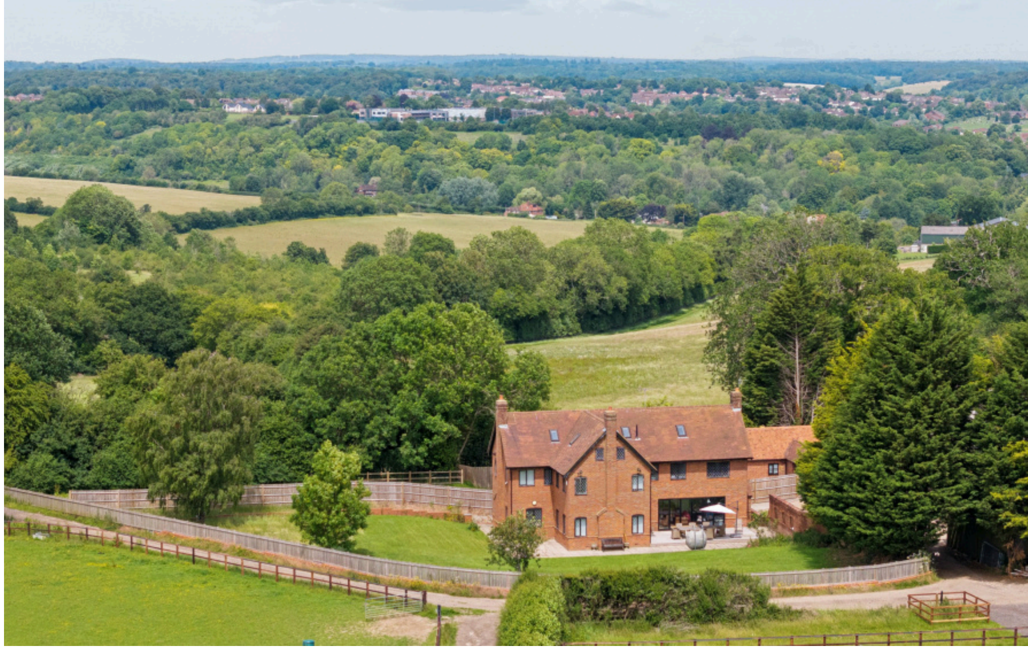
BRICK KILN FARMHOUSE, AMERSHAM