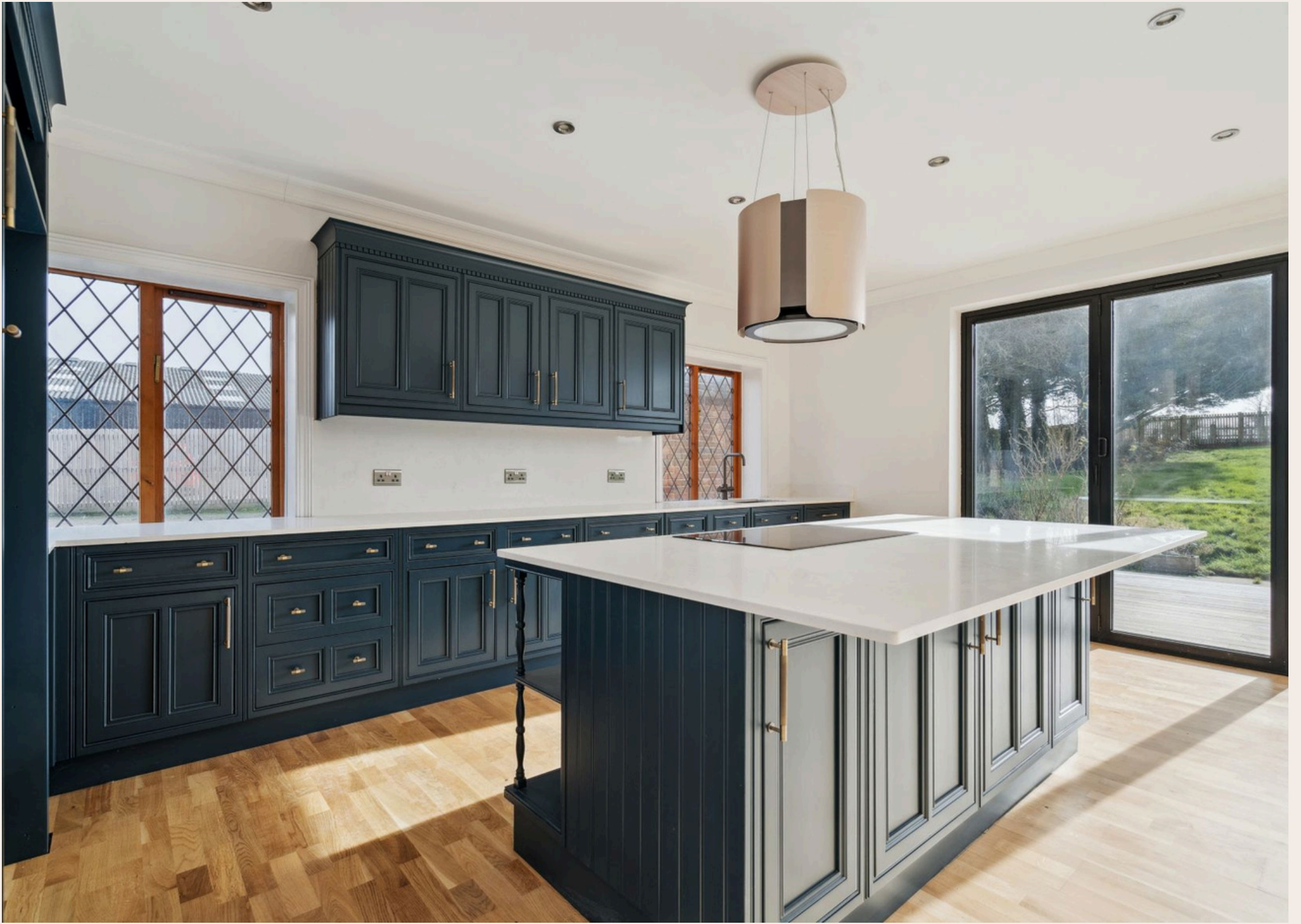
BRICK KILN FARMHOUSE, AMERSHAM