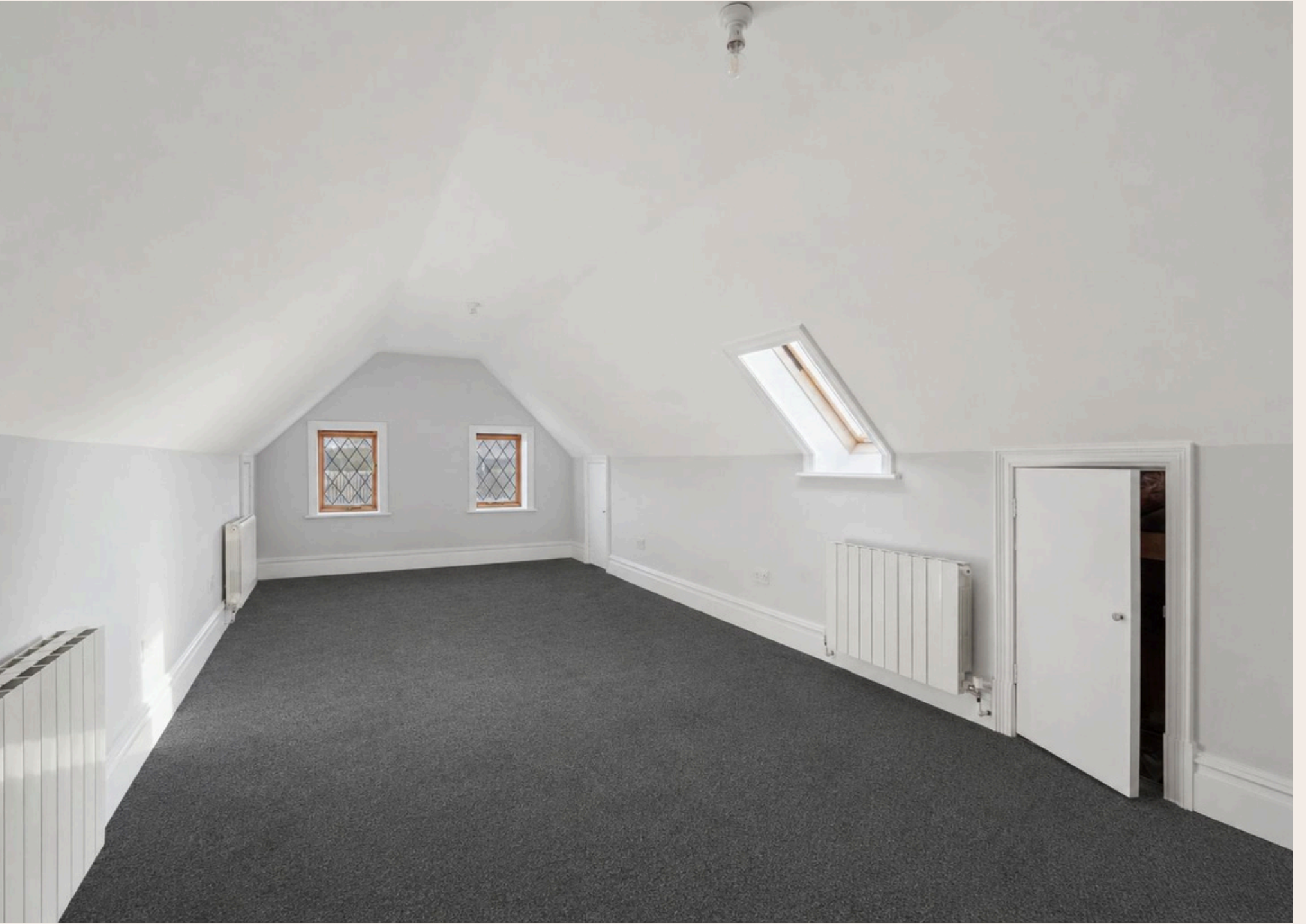
BRICK KILN FARMHOUSE, AMERSHAM