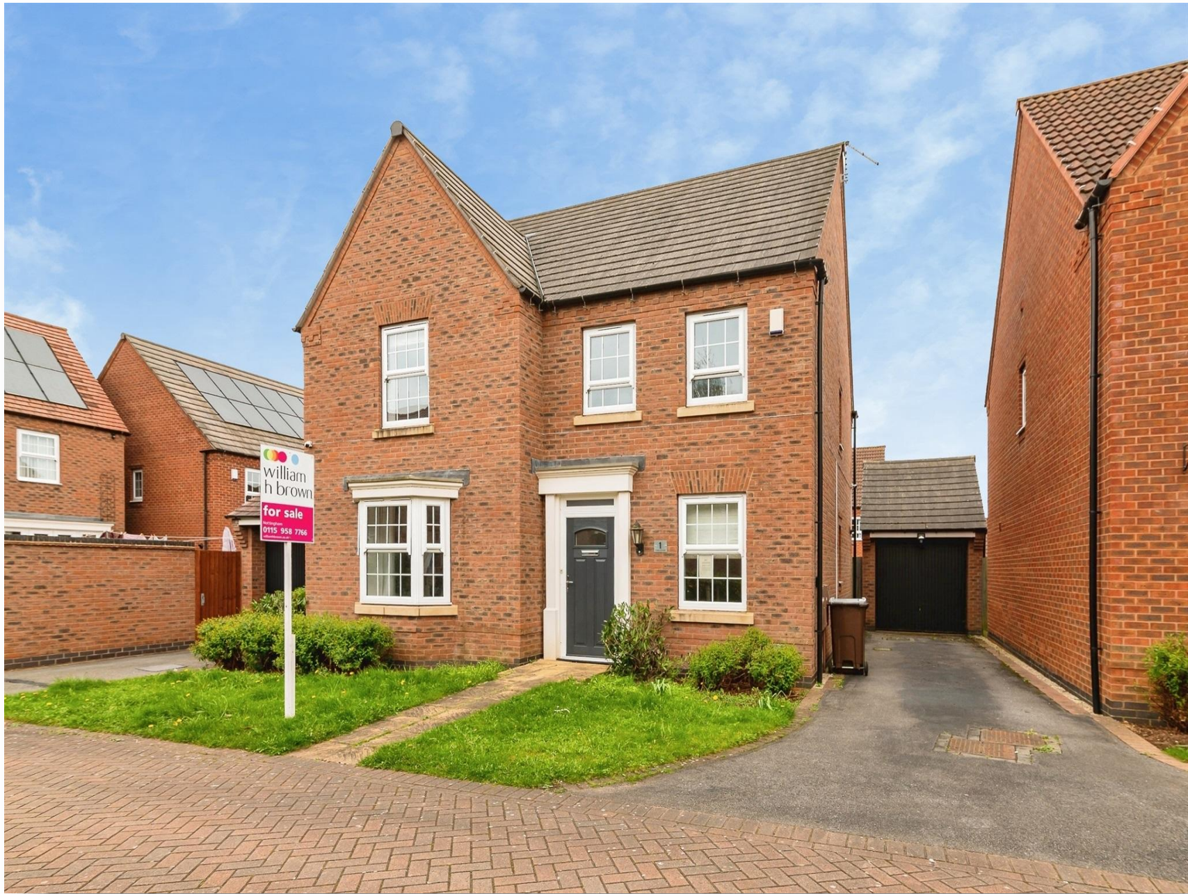
Alvina Gardens, Nottingham NG8 6JH