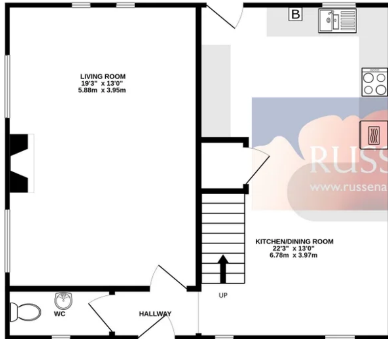
GROUND FLOOR 581 sq.ft. (54.0 sq.m.) approx.