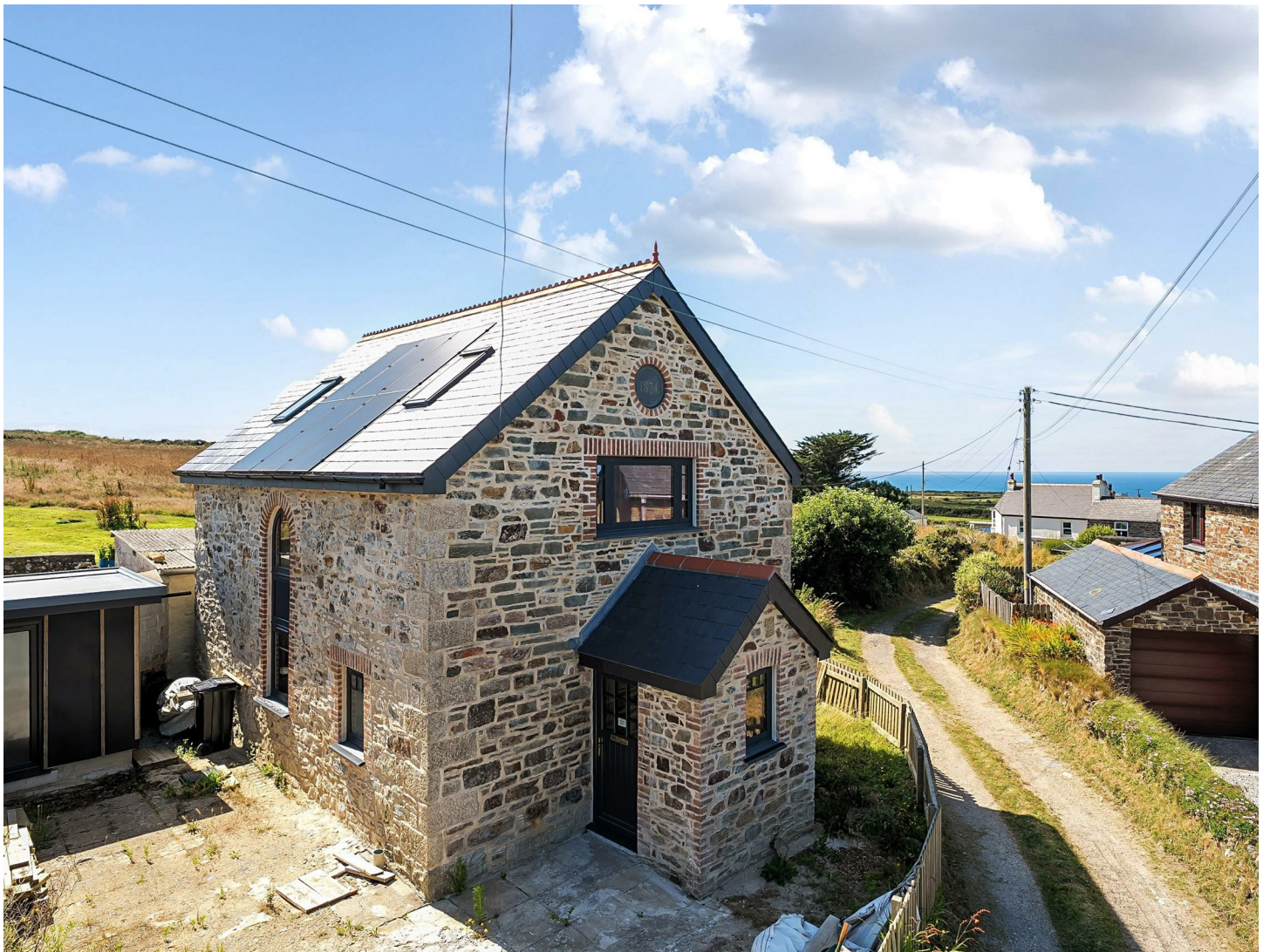
The Old Chapel