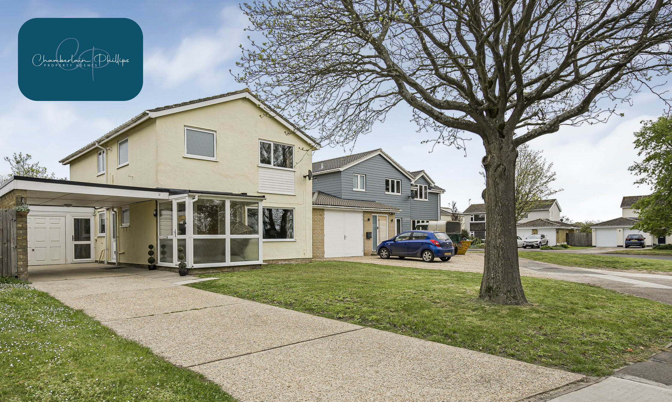
Richardsons Road, East Bergholt