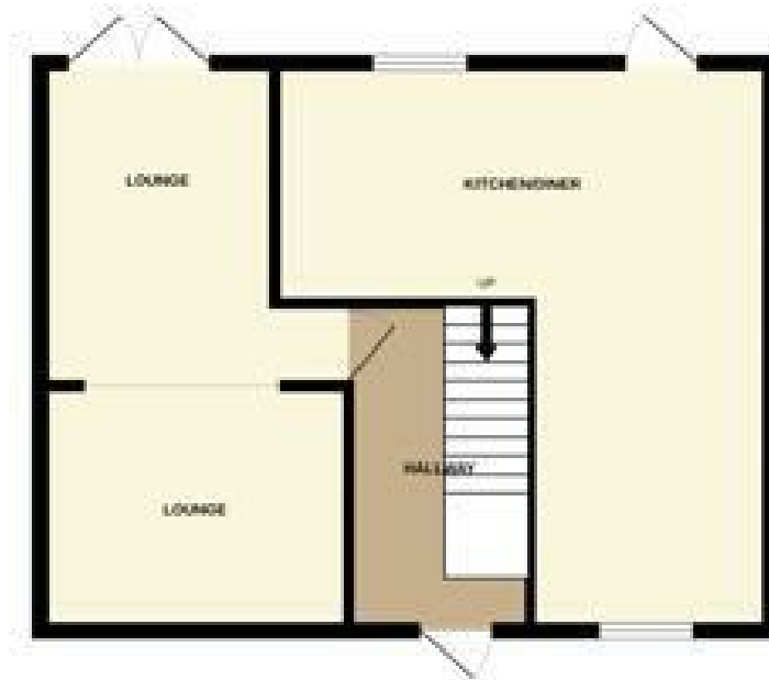
GROUND FLOOR 510 sq.ft. (47.3 sq.m.) approx.