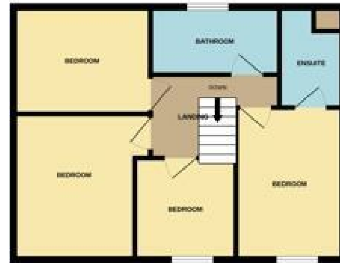
1ST FLOOR 519 sq.ft. (48.2 sq.m.) approx.