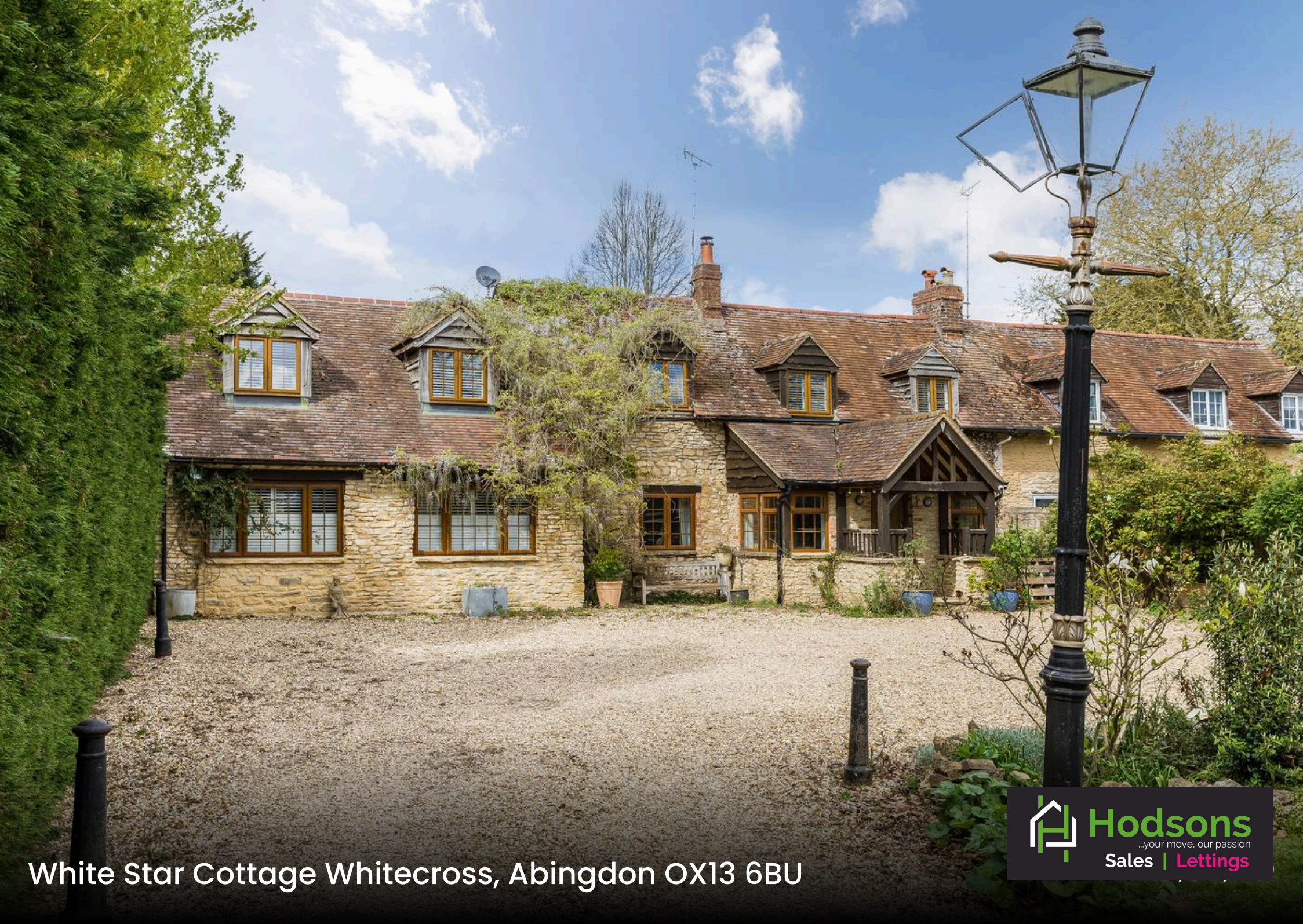
White Star Cottage Whitecross, Abingdon OX13 6BU