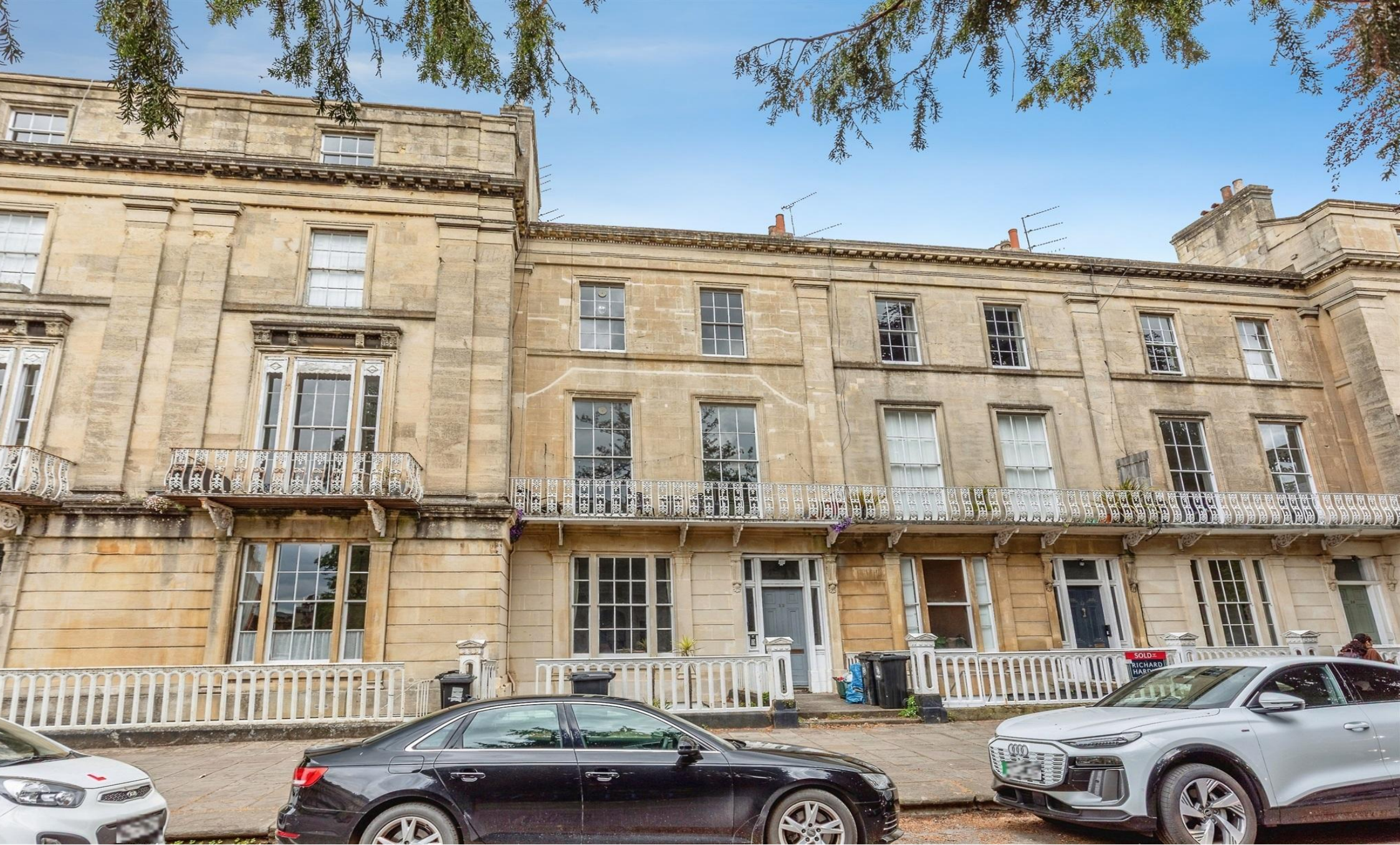
Flat 5 Lansdown Place, Bristol BS8 3AF