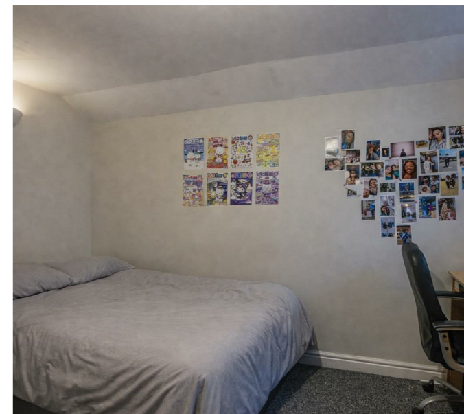
Merthyr Street, Cathays