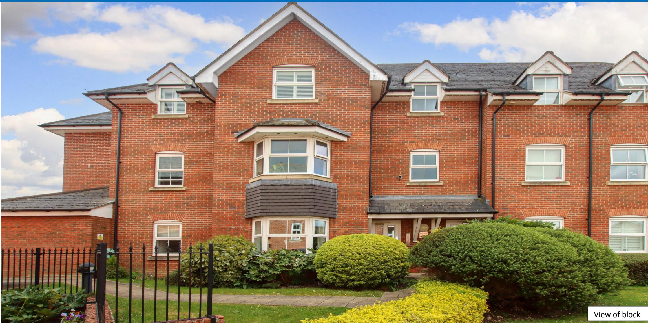
View of block