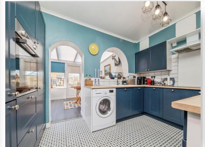
Chapel Field, Bramford, Ipswich, IP8 4HR