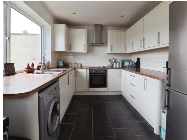
Guys Road, Barry CF63 3QA