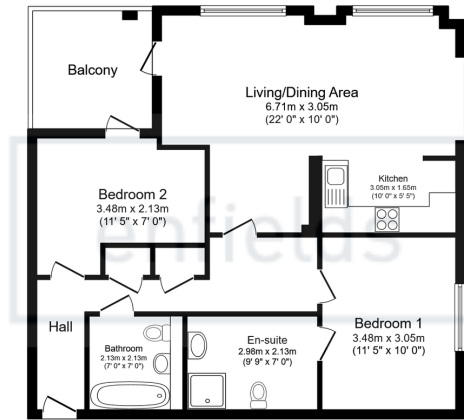
Floor Plan Floor area 78.1 sq.m. (840 sq.ft.)

Total floor area: 78.1 sq.m. (840 sq.ft.)