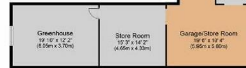
Ground Floor Approximate Floor Area 908 sq. ft. (84.3 sq. m.)

Whilst every attempt has been made to ensure the accuracy of the floor plan contained here, measurements of doors, windows, rooms and any other items are approximate and no responsibility is taken for any error, omission, or mis-statement. The measurements should not be relied upon for valuation, transaction and/or funding purposes. This plan is for illustrative purposes only and should be used as such by any prospective purchaser or tenant.