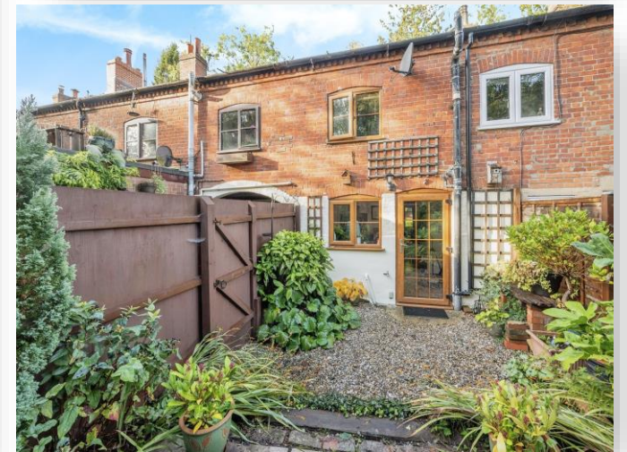
Mole End Cottage, Brook Street, Buxton, Norwich, NR10 5HF