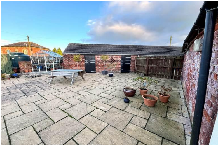
Large Patio Area