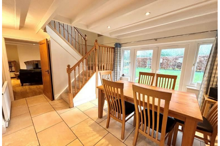
Dining Kitchen with French doors