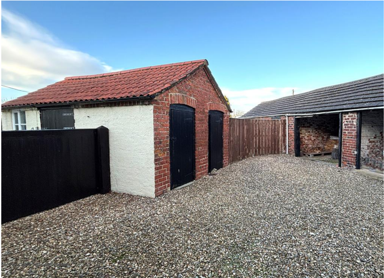
Gravel Driveway and Outbuildings