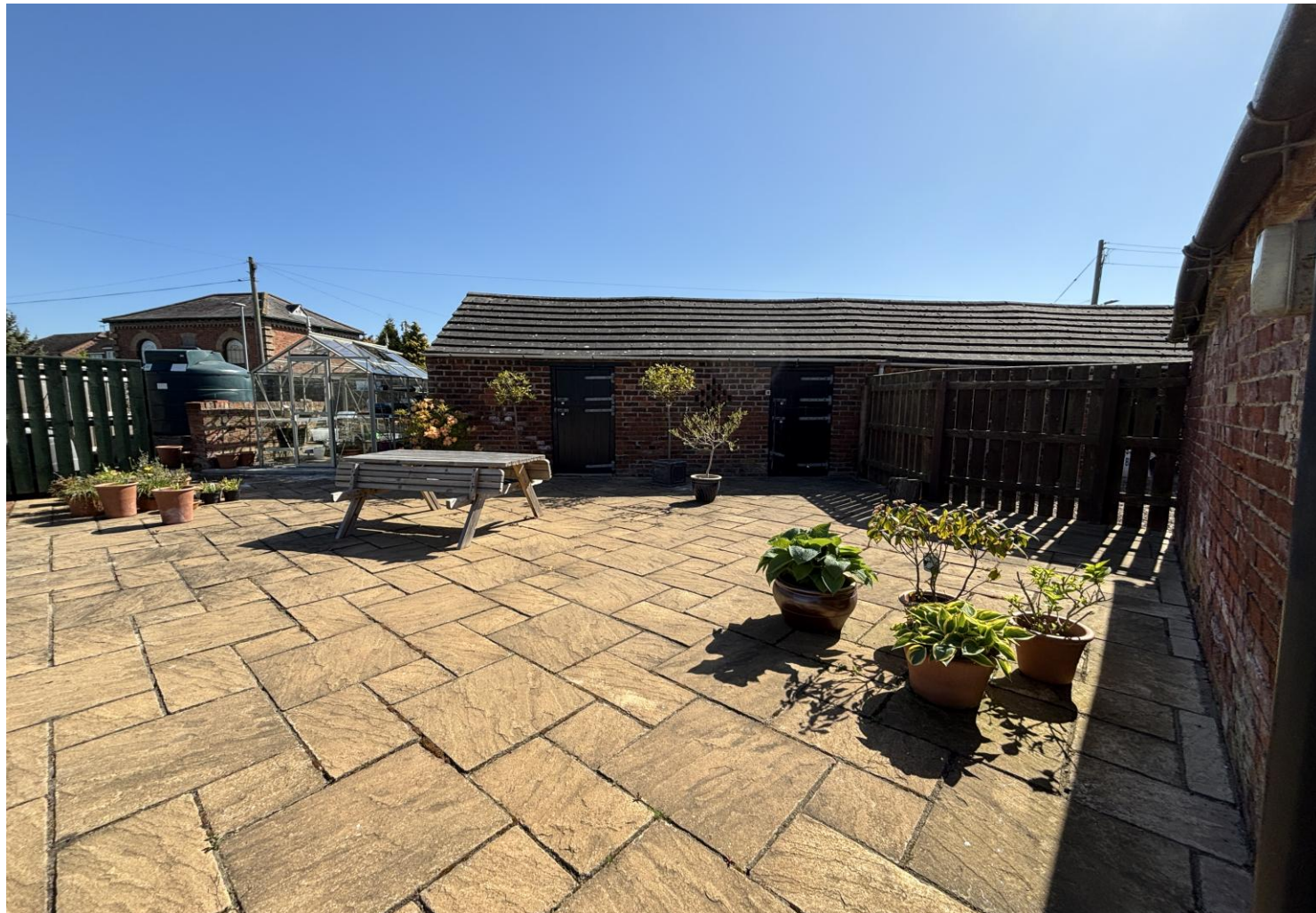
Large patio area

The stated EPC floor area, (which may exclude conservatories), is approximately 188 sq m