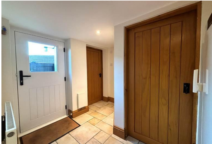
Rear Entrance Hall