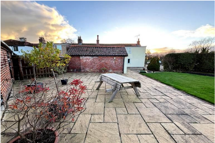
Large Patio Area