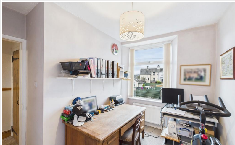
Bedroom 3 / Office