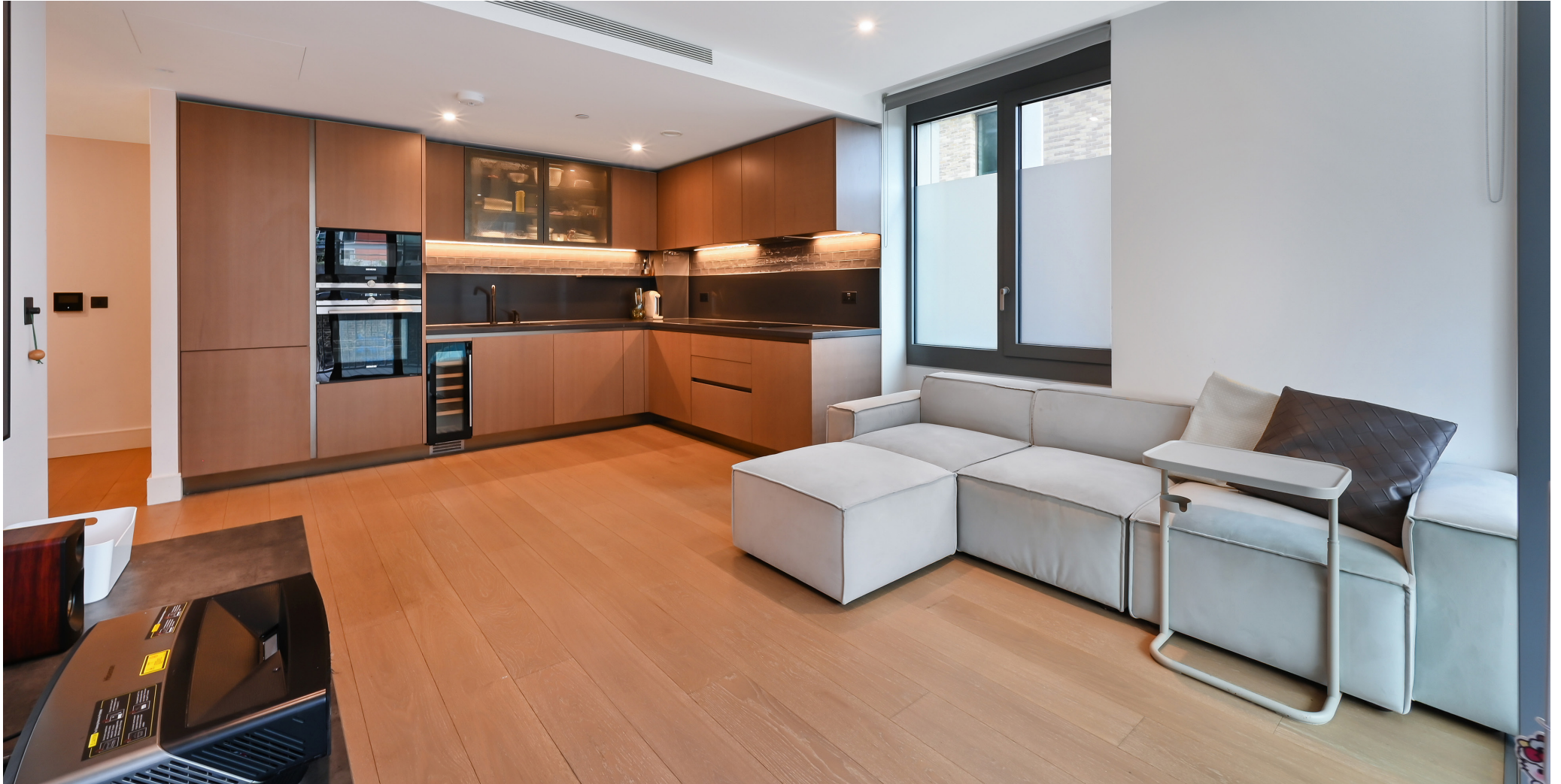
BOWDEN HOUSE, Battersea SW11