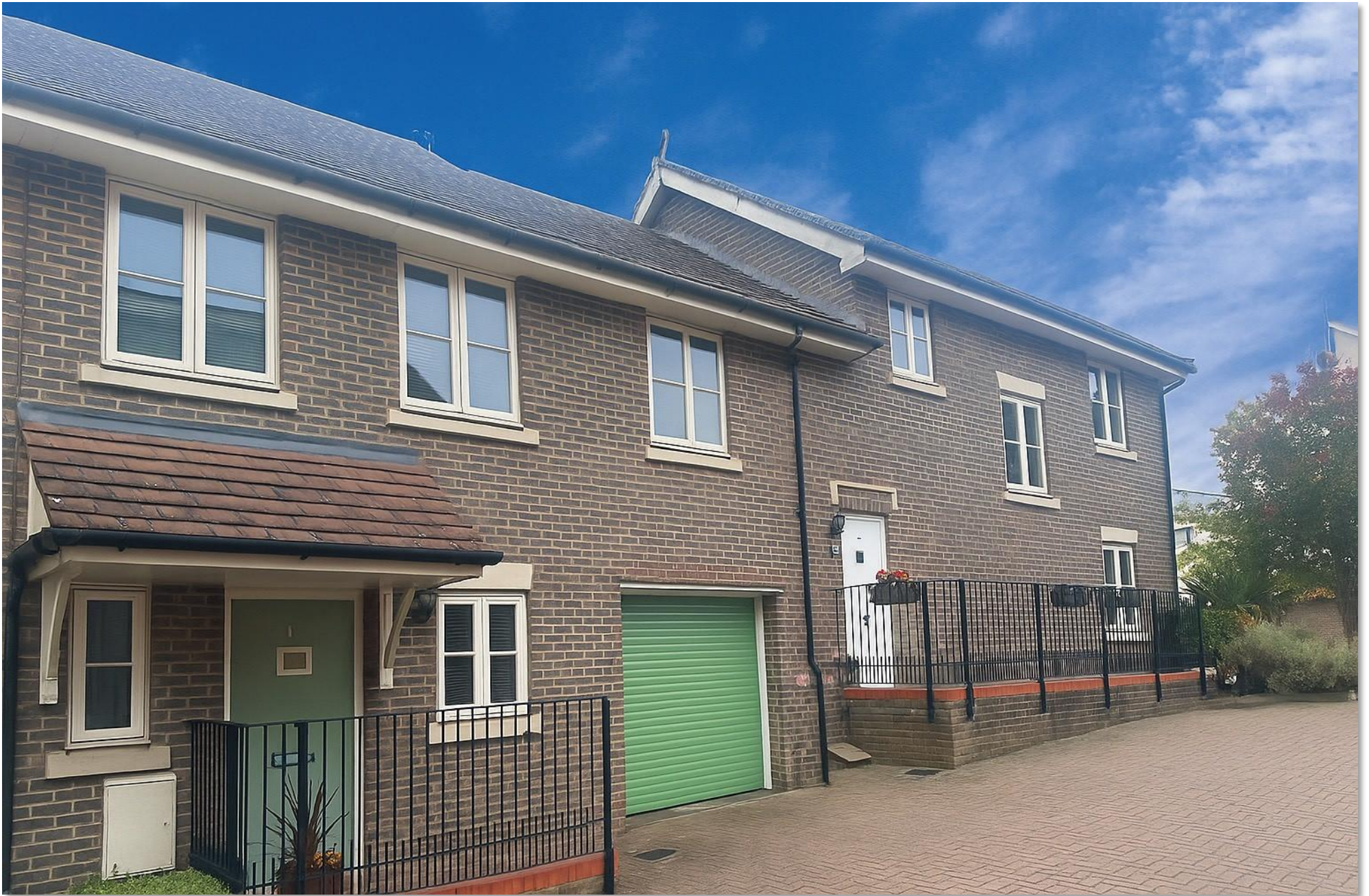
Sheldon Way, Berkhamsted HP4 1FG