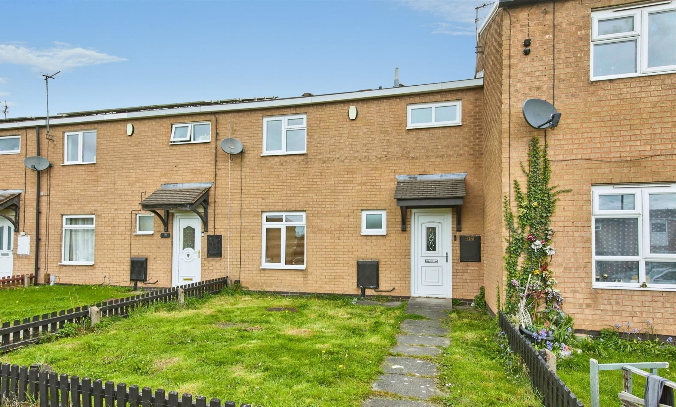
Grampian Way, Sinfon Derby DE24 9NN