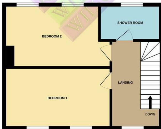
TOTAL FLOOR AREA : 886sq.ft. (82.3 sq.m.) approx.

Whilst every attempt has been made to ensure the accuracy of the floorplan contained here, measurements of doors, windows, rooms and any other items are approximate and no responsibility is taken for any error, omission or mis-statement. This plan is for illustrative purposes only and should be used as such by any prospective purchaser. The services, systems and appliances shown have not been tested and no guarantee as to their operability or efficiency can be given. Made with Metropix ©2025