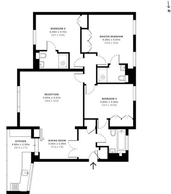
- Second Floor

GROSS INTERNAL AREA (GIA) The footprint of the property. 101.86 sqm / 1096.41 sqft NET INTERNAL AREA (NIA) Excludes walls and external features Includes mezzanine, vertical road bridge 91.42 sqm / 984.04 sqft EXTERNAL STRUCTURAL FEATURES Balconies, verandas, terraces etc. 0.00 sqm / 0.00 sqft RESTRICTED HEAD HEIGHT Limited use area under 1.9m 0.00 sqm / 0.00 sqft