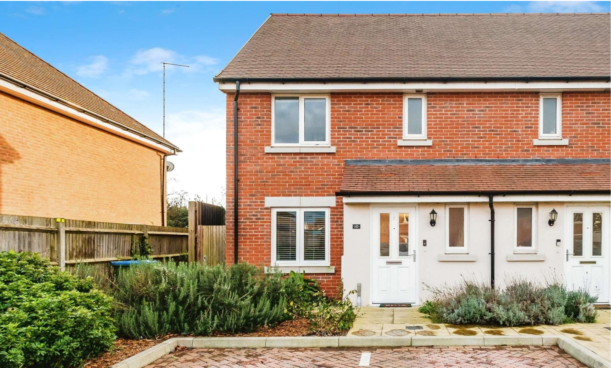
Petunia Grove, Wick Littlehampton BN17 7TS