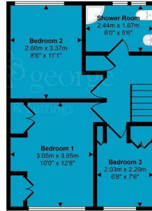
First Floor Approx 38 sq m / 408 sq ft

This floorplan is only for illustrative purposes and is not to scale. Measurements of rooms, doors, windows, and any items are approximate and no responsibility is taken for any error, omission or mis-statement. Icons of items such as bathroom suites are representations only and may not look like the real items. Made with Made Snappy 360.