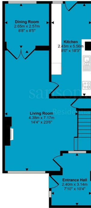
Ground Floor Approx 57 sq m / 614 sq ft

Approx Gross Internal Area 95 sq m / 1021 sq ft