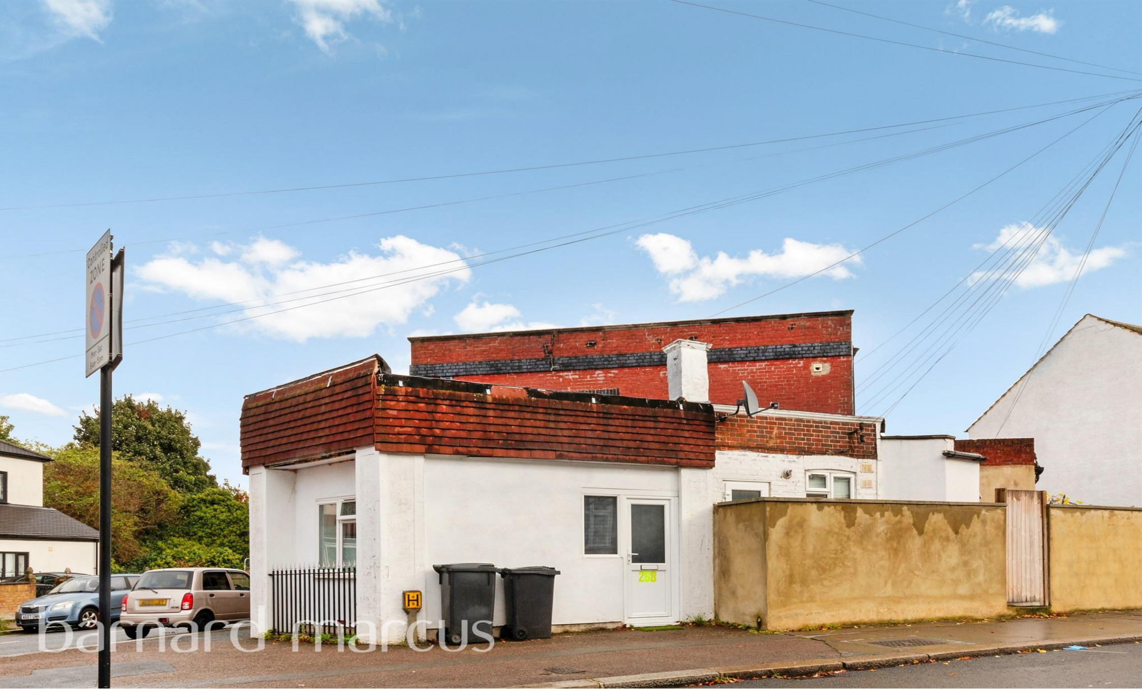
Woodmansterne Road, London SW16 5TR