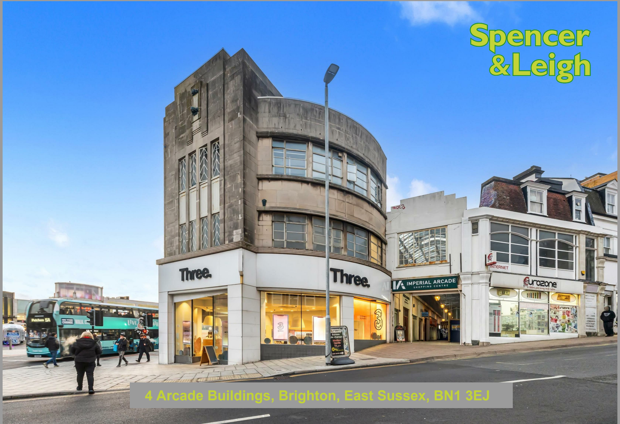
4 Arcade Buildings, Brighton, East Sussex, BN1 3EJ