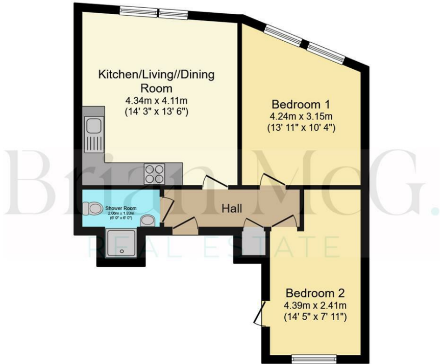
Floor Plan Floor area 47.8 m 2 (514 sq.ft.)