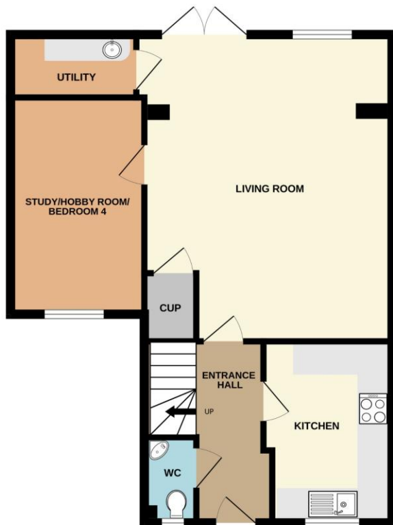
GROUND FLOOR 631 sq.ft. (58.6 sq.m.) approx.