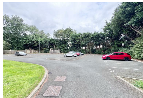
26 Rymers Court, Darlington, DL1 2GB.

We are acting in the sale of the above property and have received an offer of £65,000 on the above property.