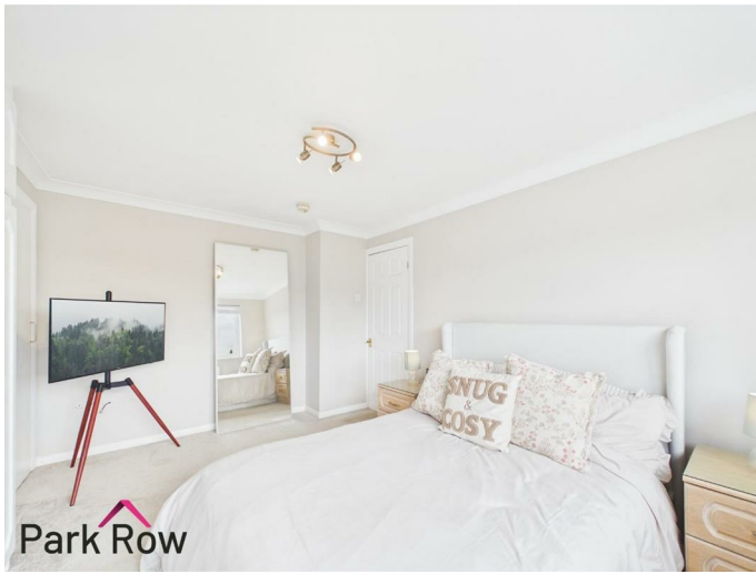
BEDROOM THREE 8'7" x 6'7" (2.62 x 2.03)