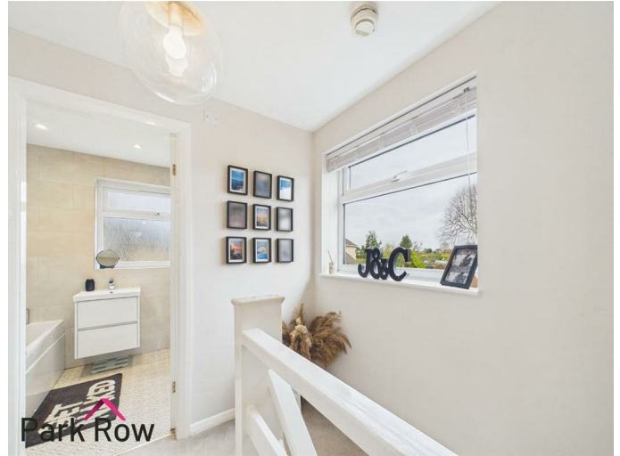
LANDING 9'0" x 6'9" (2.76 x 2.07)

Loft access, a door which leads into a storage cupboard and further internal doors which lead into;