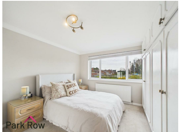
BEDROOM ONE 13'1" x 10'7" (3.99 x 3.24)

A double glazed window to the front elevation, built in white wooden wardrobes and a central heating radiator.