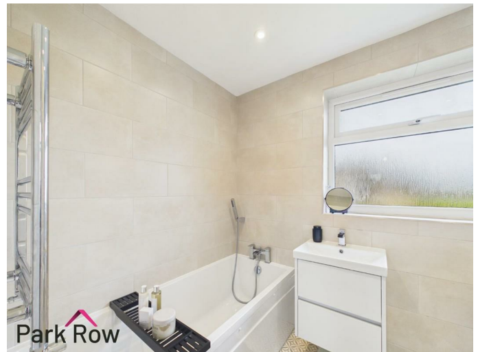
An obscure double glazed window to the rear elevation and includes a modern white suite comprising; a panel bath with a showerhead attachment over, a separate walk-in shower enclosure with glazed screen, a close coupled w/c, a hand basin set within a white unit with space for storage, a chrome heated towel rail, LED spotlights to the ceiling, fully tiled walls and patterned tiled flooring