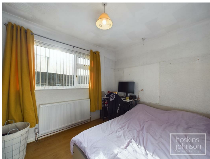
Bedroom 3 11'3" x 8'2" (3.43 x 2.50)

Double glazed window to rear, radiator, coved ceiling, laminated wood flooring.