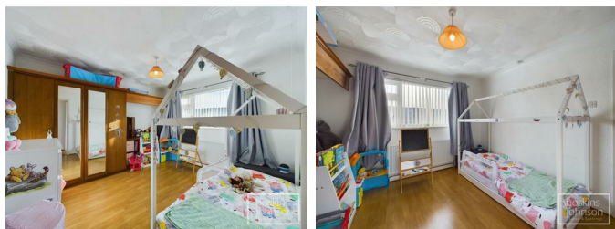
Bedroom 2 11'8" x 10'11" (3.56 x 3.34)

Double glazed window to rear, radiator, coved ceiling, laminated wood flooring, fitted wardrobes.