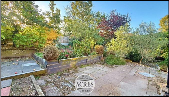
Hook Drive, Sutton Coldfield, B74 4LW