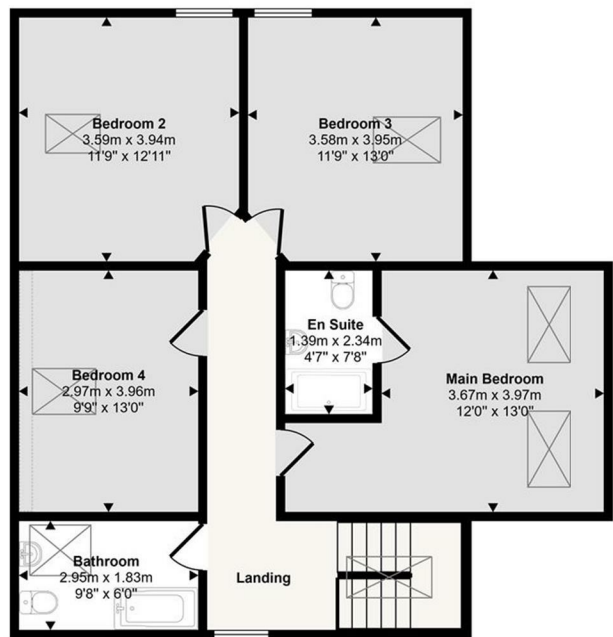
First Floor Approx 83 sq m / 889 sq ft

This floorplan is only for illustrative purposes and is not to scale. Measurements of rooms, doors, windows, and any items are approximate and no responsibility is taken for any error, omission or mis-statement. Icons of items such as bathroom suites are representations only and may not look like the real items. Made with Made Snappy 360.