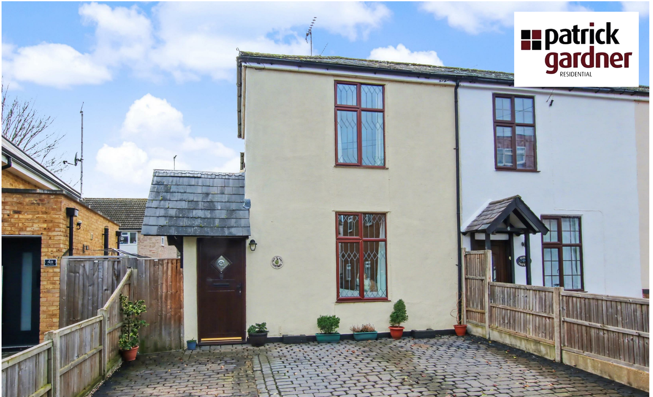
Old Oak Cottage, 5 Oak Road, Leatherhead, Surrey, KT22 7PH