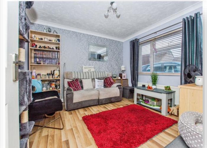
Elm Low Road, Wisbech PE14 0DF