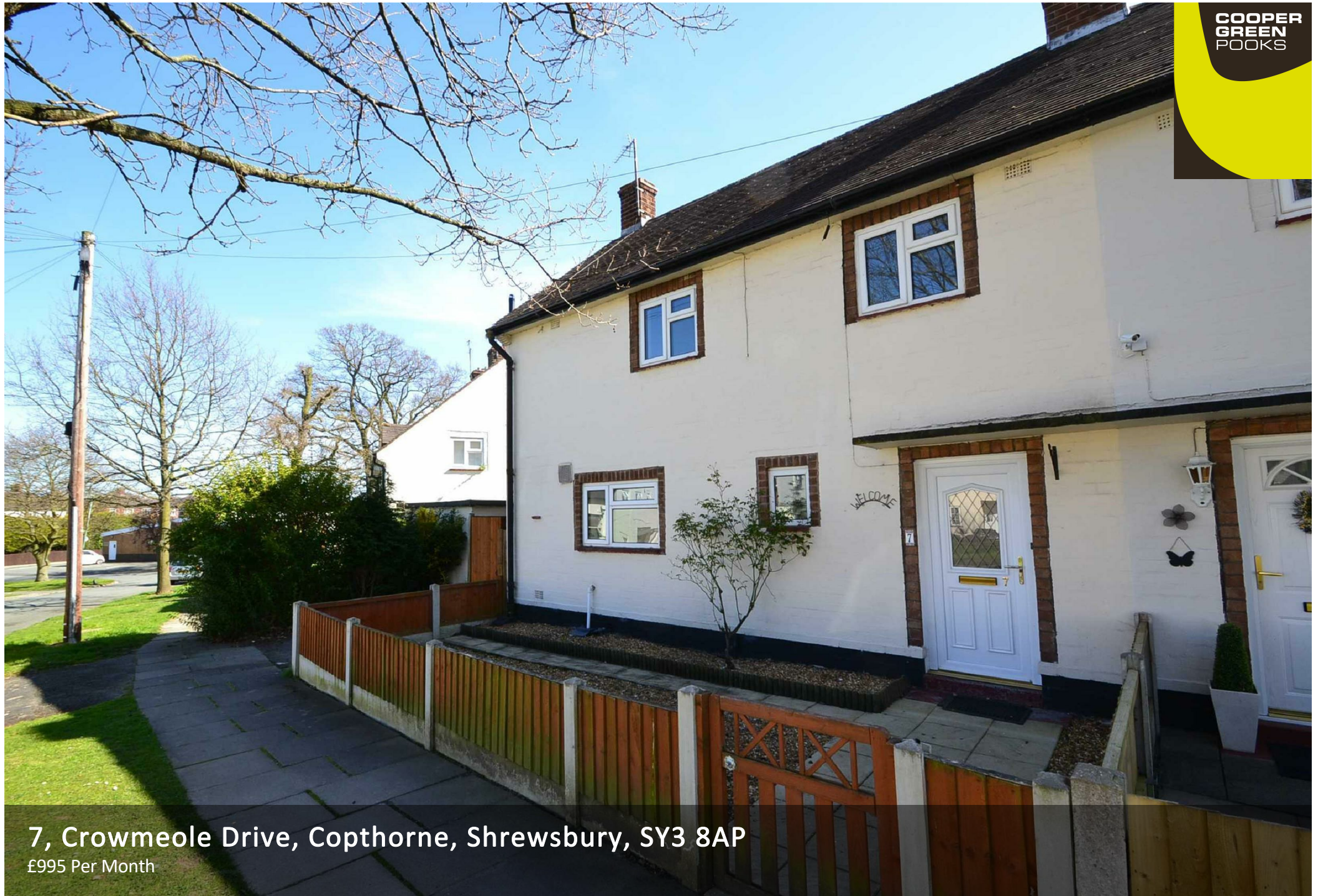
7, Crowmeole Drive, Copthorne, Shrewsbury, SY3 8AP £995 Per Month