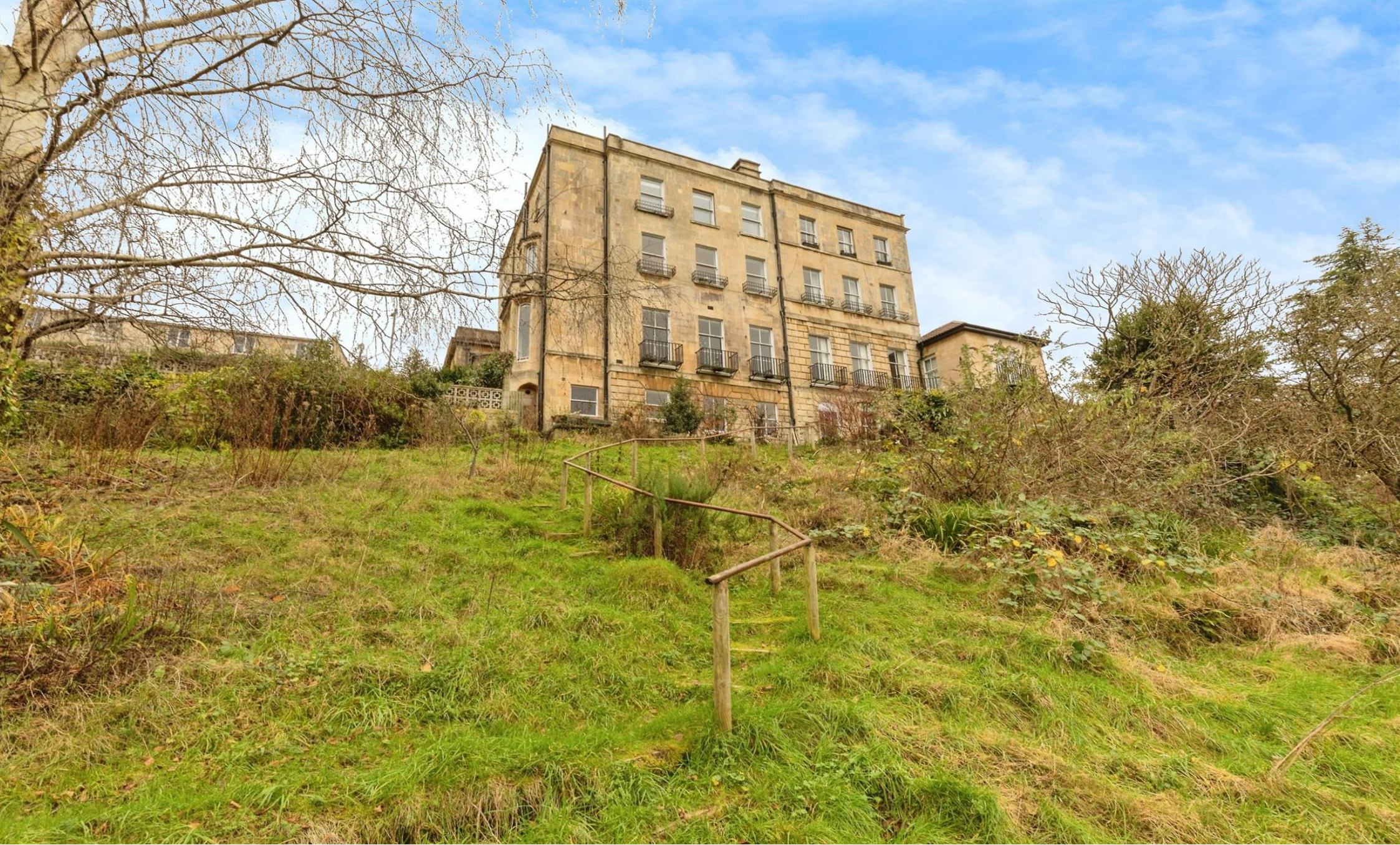
Hampton Hall, Warminster Road, Bath, BA2 6SQ