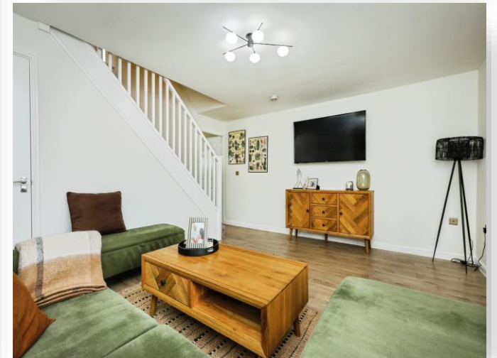
Kirker Close, Goldthorpe Rotherham S63 9FG