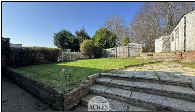
Ferndale Avenue, Great Barr, B43 5QF