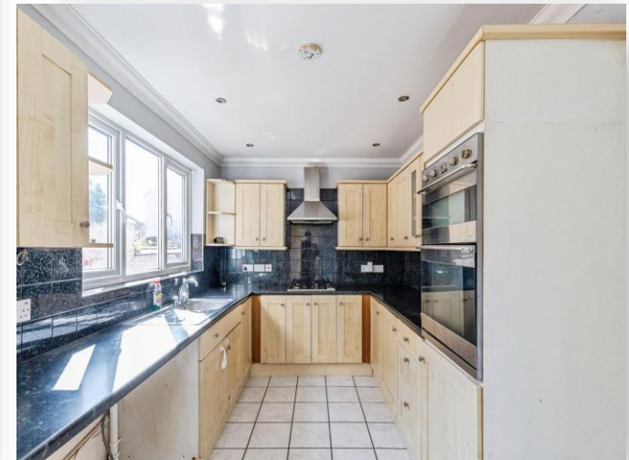
Vivian Road, Wellingborough NN8 1JJ