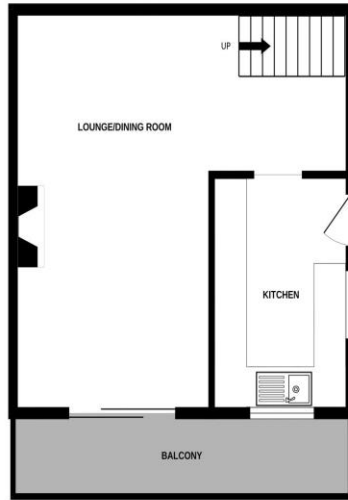
GROUND FLOOR 405 sq.ft. (37.6 sq.m.) approx.