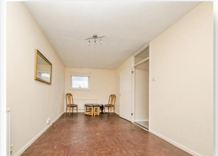
William Boys Close, Colchester, CO4 3PW